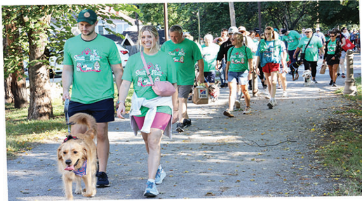
PICTURED ABOVE: Participants strutting the 5k.

Big tail wags to everyone who participated in the 33rd Annual Strutt With Your Mutt on Sunday, September 24. Whether you ran, Strutted, volunteered, or donated, your generosity raised funds to rescue and care for the homeless animals at Wayside Waifs.