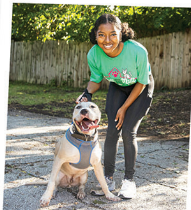
PICTURED LEFT: These two had a great time raising funds for the homeless animals at Wayside.

We hope you'll join us for the 34th Annual Strutt With Your Mutt which is currently planned for September 29, 2024!