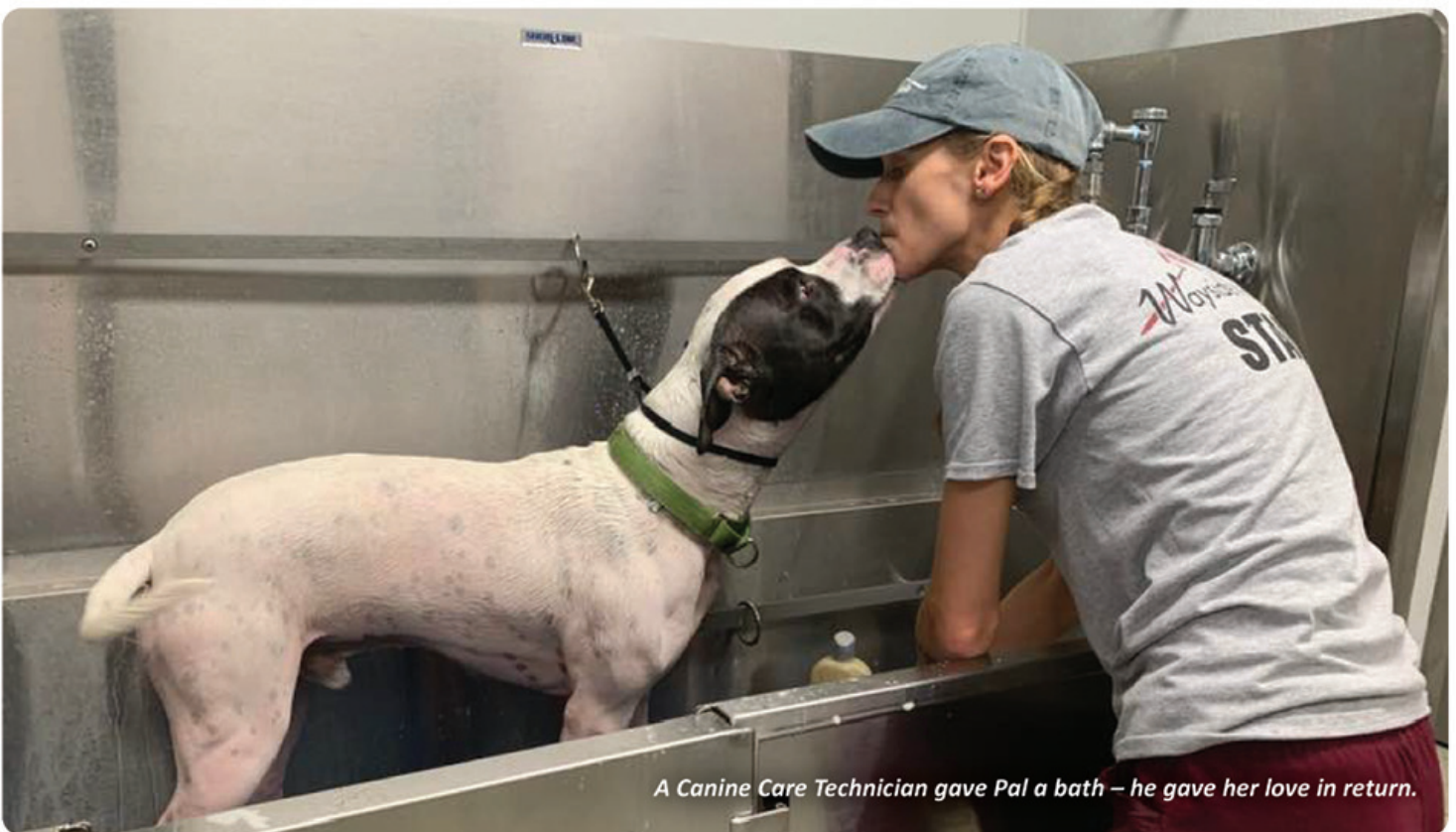
A Canine Care Technician gave Pal a bath – he gave her love in return.