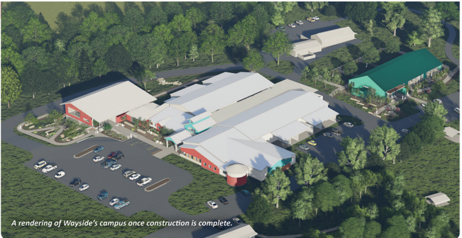
A rendering of Wayside's campus once construction is complete.

For the past 75 years, Wayside has helped abandoned, abused, and homeless animals. We know that lives will continuously need saving and, because of generous supporters, we'll make sure that happens. In fact, we recently broke ground on a new building and expansion of the current building which allows for more animals to stay in our care.