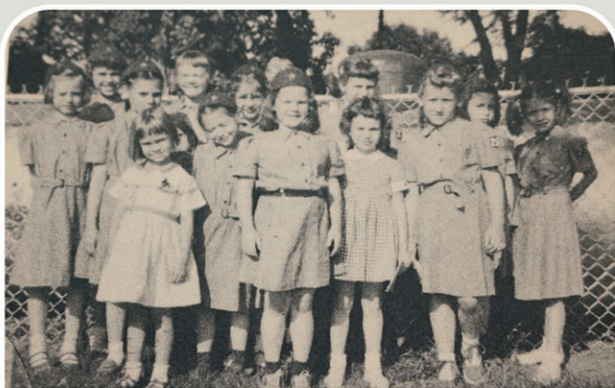
Wayside established the first Humane Education program for kids in the region. Here a Brownie Troop visited the shelter in the 1940s.