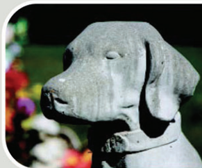
In 1946 Top of The World Pet Cemetery was started on our campus. Today the cemetery has more than 14,000 beloved pets buried there.