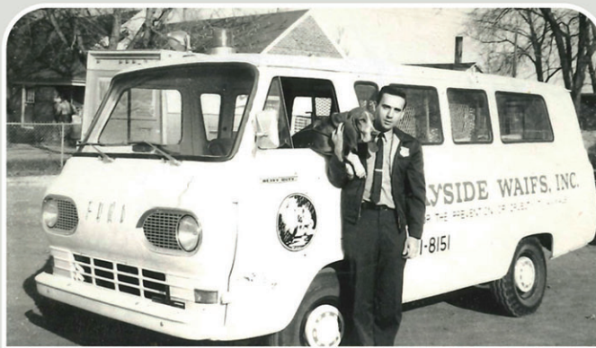
Our rescue work began when the shelter opened in 1944. In addition to saving strays, rescue efforts included the 1951 Kansas City Flood and the 1957 Ruskin Heights Tornado.