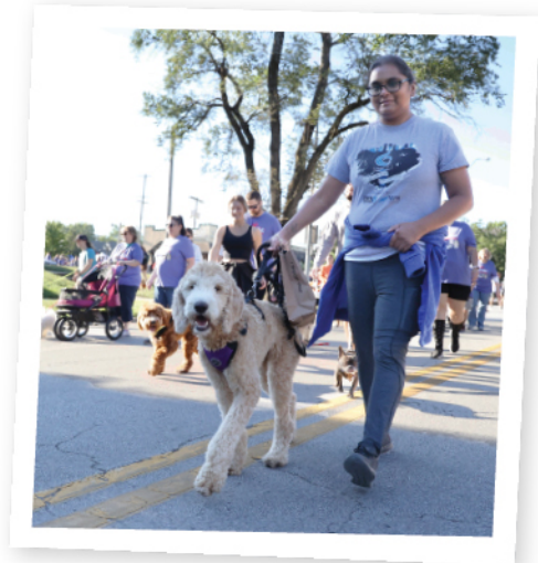
PICTURED ABOVE: Enjoying the beautiful morning with her dog to raise money for the homeless animals.

Melcher Investment Company, Rob Sight Ford, Ameristar Cares, Hill's Science Diet, Demdaco, Dechra Veterinary Products, Landers' Visions, JNA Advertising, Lily's Play N Stay, JE Dunn, Camp Bow Wow, Noah's Ark, Mission Driven, On The Ball, Westlake Hardware, 99.7 The Point, The Kansas City Star, and KMBC Channel 9!