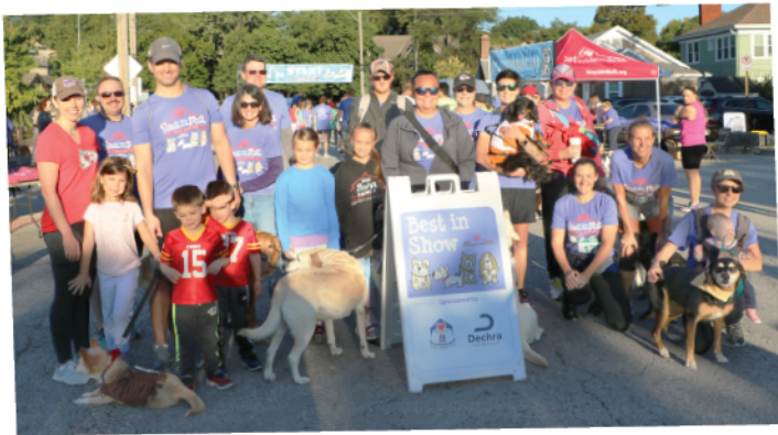
PICTURED ABOVE: Team Dechra - employees participated that day and the company sponsored the event.

Big tail wags to everyone who participated in the 32nd Annual Strutt With Your Mutt on Sunday, September 25. Whether you ran, Strutted, volunteered, or donated, your generosity raised funds to rescue and care for the homeless animals at Wayside Waifs.