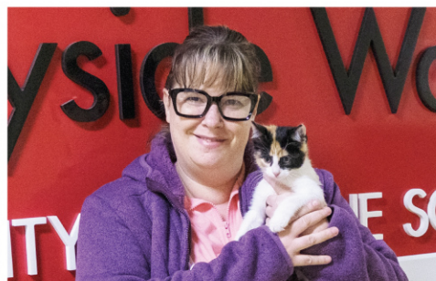
Precarious, adopted in November