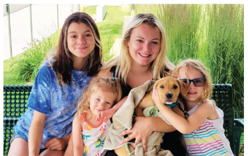
Waffle, adopted in June