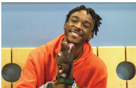
Ranger, adopted in November