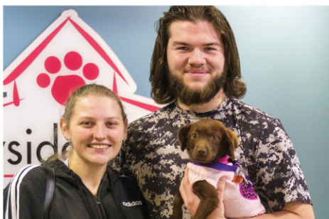
Maze, adopted in April