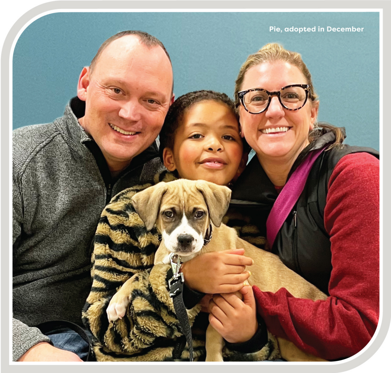
Pie, adopted in December